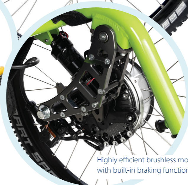
Highly efficient brushless motors with built-in braking function

For more information or to arrange a FREE no obligation home demonstration call us now!