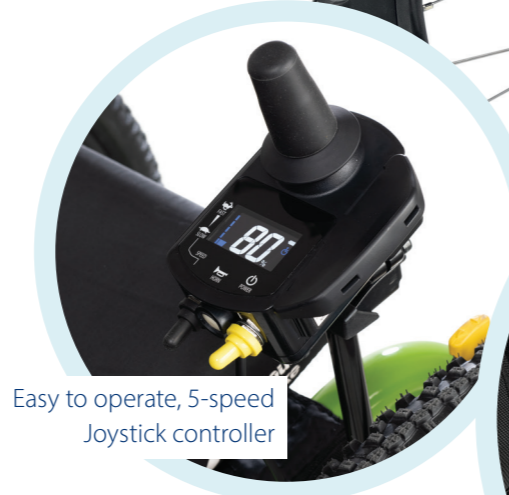
Easy to operate, 5-speed Joystick controller