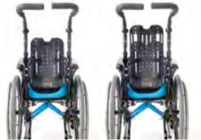
Height adjustment feature