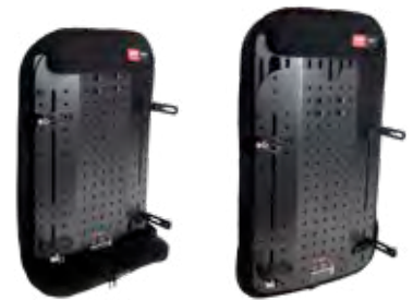
Padding tucks under back support when at lower height range