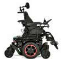
Q300 M Mini Kids