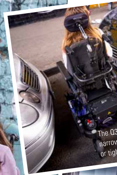
The Q3 narrow or tight