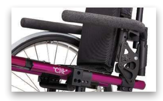
Clik's unique swing away armrest allows for independent angle adjustability, while integrated into the backrest for easy growth. Your arm is always where you need it.

Whether setup in mid-wheel for the smallest riders or to help promote and teach the balance and wheeling skills that encourage confidence to overcome everyday obstacles and terrain. Be Dynamic.