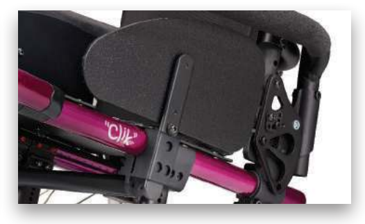
The replaceable cross tube with TAPER LOK increases Clik's rigidity resulting in an easier to push chair. Optional integrated receivers use less space so you can get everything in the right spot. The first time.