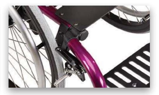
Compound offset frames ensure your kid has the fit they need. More room for abducted positioning, AFO's and braces.