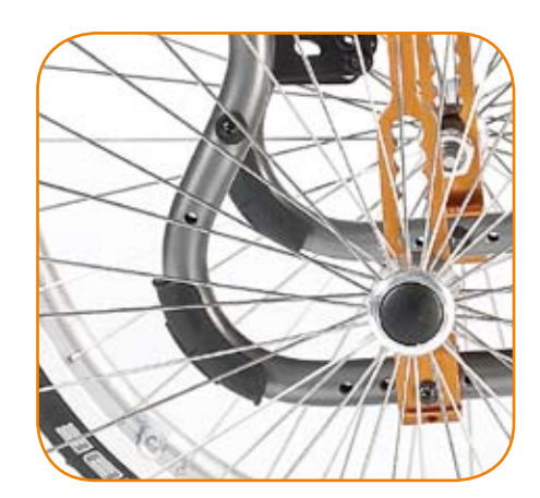
Rear frame protection to protect the frame for transfers