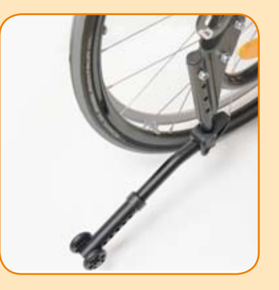
Lightweight anti-tip for optimal driving performance with 480g weight reduction.