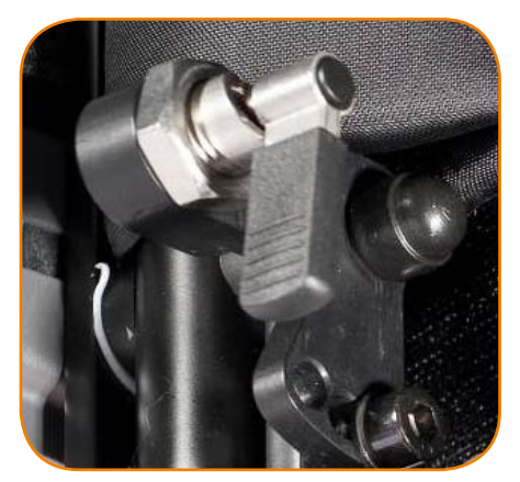
Small folding with a double locking system for easy lifting