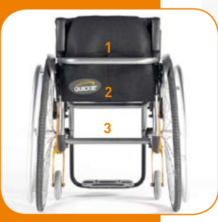
Three stabiliser bars deliver rigidity for performance and longevity