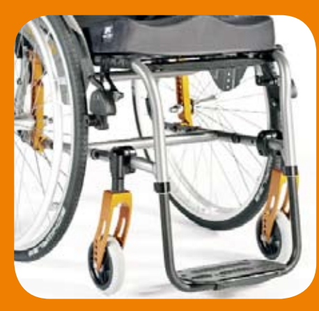
Fixed front frame for ultimate rigidity and performance.