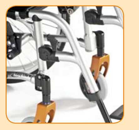
NEW Aluminium lightweight hangers in 70° and 80°. 13% lighter than standard Quickie hangers