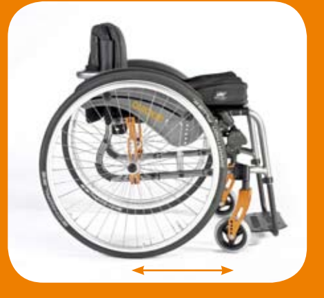
Excellent rolling performance via compact adjustable wheel base