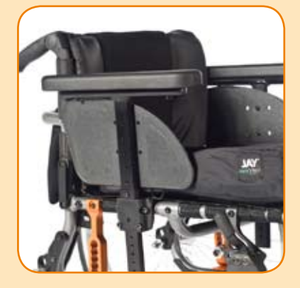
NEW Tool height adjustable armrest Lightweight modern looks with one pad for easy transfer and low transport weight