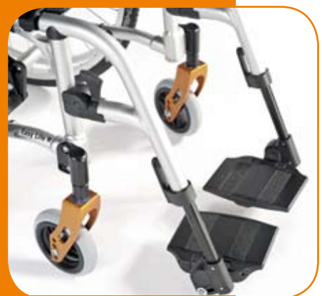
Swing-away option/Xenon lightweight hangers with easy to use trigger mechanism.