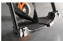
Footboard, divided, composite, angle- adjustable, flip-up (sideways), heel loop, black