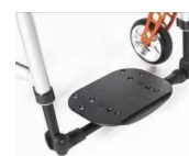
Footboard, platform, lightweight, plastic, angle & depth-adjustable flip up (sideways), calf strap