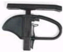
Single post height adjustable