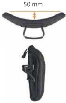
Jay 3 Back Shallow Contour