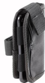
Mobile phone pocket