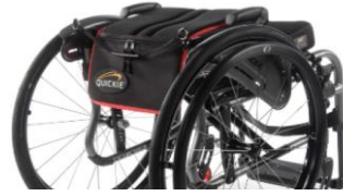
Backrest, fold down (to the front)