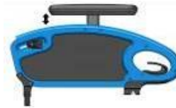
Desk sideguard, armpad, height-adjustable, flip-up, remove