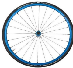
Lightweight wheel, anodized blue