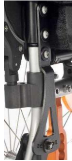
Backrest, angle adjustable