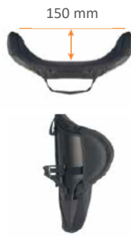
Jay 3 Back Deep Contour