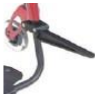
Caddy, flip-up bracket for bags