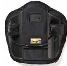
Jay Zip Back