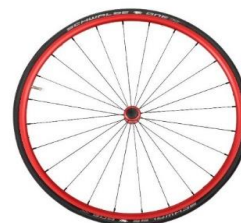
Lightweight wheel, anodized red