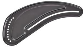
Aluminium sideguard, wet weatherprotection (in frame colour)