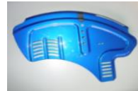
Aluminium sideguard, fender, wet weatherprotection (in frame colour)