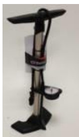
High pressure pump