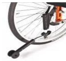
Anti-tip tubes, swing- away, left