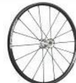
Rear wheel, Spinergy, 18 spokes (black), straight spokes; hub: silver