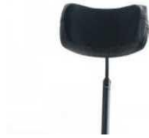
Headrest, height, depth and angle adjustable