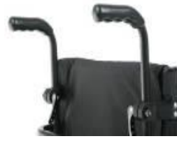
Push handles, height-adjustable