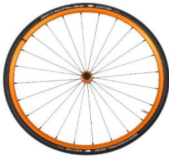
Lightweight wheel, anodized orange