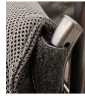
Without push handles,