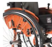
Push to lock brake, integrated in sideguard, Safari