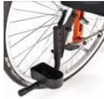
Crutch holder, loop