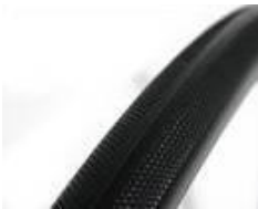
Tyre, puncture proof, tread