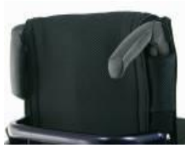
Push handles, fold-down