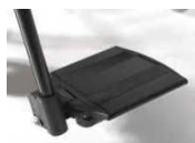
Footboard, divided, aluminium, angle- adjustable, flip-up (sideways), heel loop, black