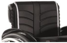
EXO backrest sling