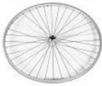
Rear wheel, Design, 36 spokes, straight spokes