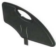
Composite sideguard, removeable (black)