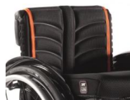
EXO PRO backrest sling