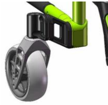
Expansion kit, designed for hemiplegic users