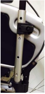
Backrest tube, aluminium