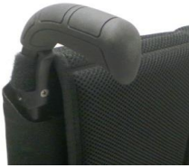
Push handles long