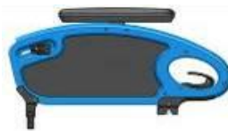
Desk sideguard, armpad, fixed, flip-up, remove