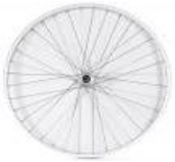
Rear wheel, Universal, 36 spokes, cross-wise spokes