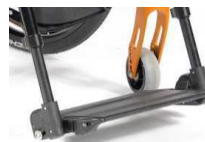
Footboard, platform, lightweight, plastic, angle & depth- adjustable flip up (sideways), calf strap, black