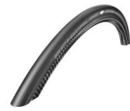
Tyre, pneumatic, slick, Schwalbe One