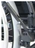
Push to lock brake, one- arm, right actuation