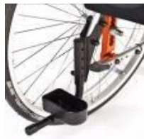
Crutch holder, loop