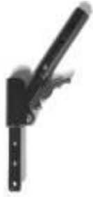
Backrest, half folding (to the back)