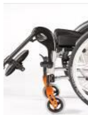
Elevating legrest (ELR)