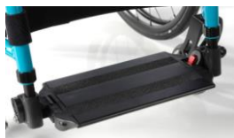
Footboard, angle and depth adjustable; flip up, aluminium with locking system