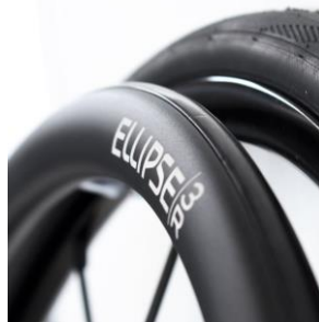
Ellipse 3R Handrim