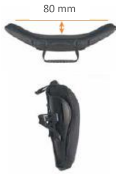
Jay 3 Back Mid Contour