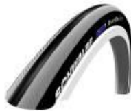
Tyre, pneumatic, fine profile, Schwalbe Right Run