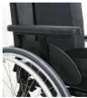
Single-post sideguard, armpad, height-adjustable, remove