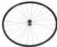
Rear wheel, Lightweight, 24 spokes, straight spokes