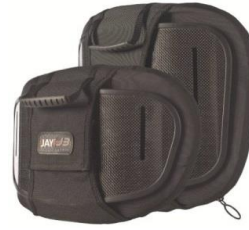
Jay 3 Carbon Back Shallow Contour