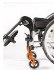
Elevating legrest (ELR)