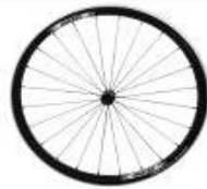
Rear wheel, Proton, 24 spokes, straight spokes