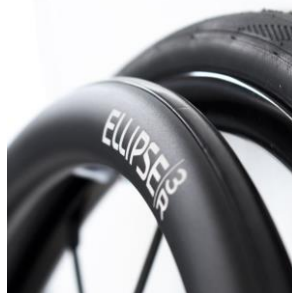
Ellipse 3R Handrim