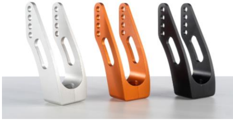
Fork Aluminium, black, orange & silver