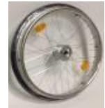
Rear wheel, drum brakes, 36 spokes, cross- wise spokes