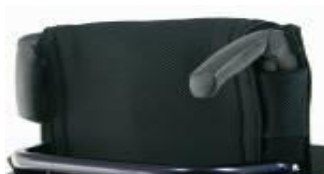
Fold down push