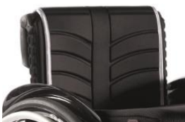
EXO backrest sling