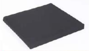
Seat cushion, cover with zipper, black