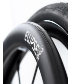
Ellipse 3R Handrim