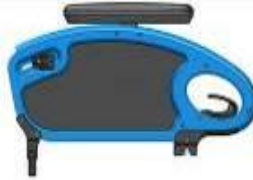
Desk armrest, fixed height, short armpad(25cm)