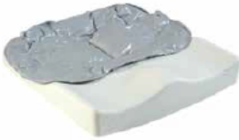
Jay Easy Fluid (picture shown without upholstery)