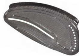
Sideguard carbon with fender