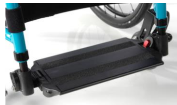
Platform, angle and depth adjustable; flip up, aluminium with locking system