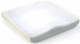
Jay Basic (picture shown without upholstery)