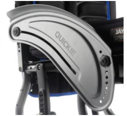
Sideguard alu with fender