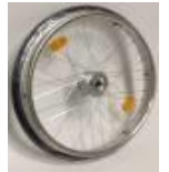
Drum brake wheel