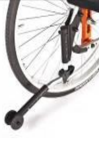
Anti-tip swing away