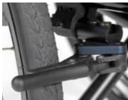
Compact wheel lock