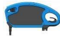
Desk armrest without armpad