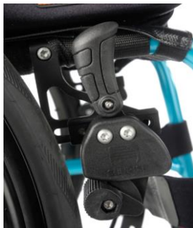
Knee lever wheel lock