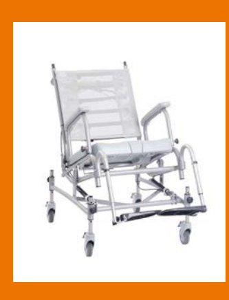
AquAlign shown in full tilt in space without headrest.