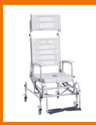
AquAlign shown in upright position with tall headrest.