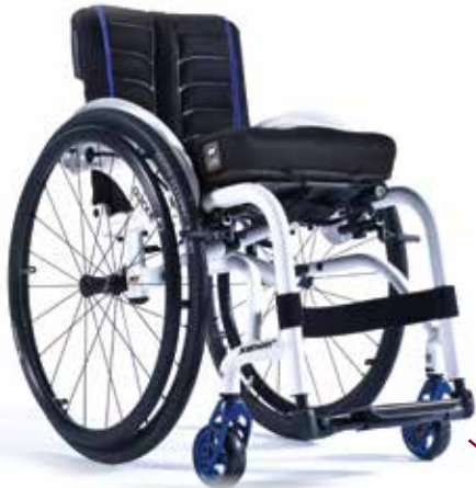
XENON² H (HYBRID) THE STRONGEST