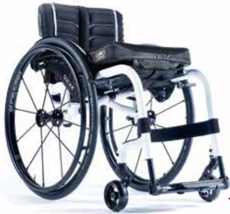
XENON² FF THE LIGHTEST