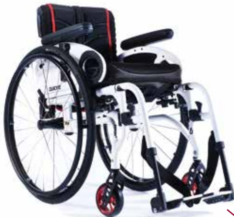
XENON² SA THE ALL ROUNDER